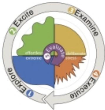
Sample of Preferred Process for an individual